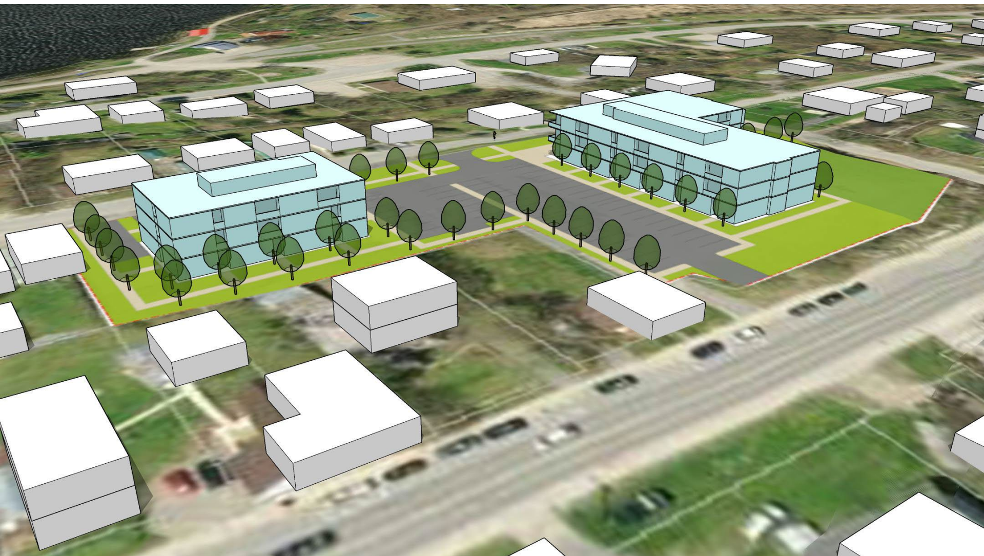
Modelling: Fotenn Consultants