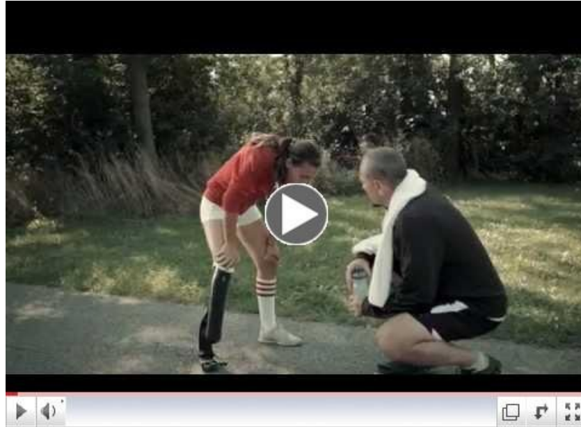
It's more than sport (:60s): A Canadian Paralympic Committee commercial