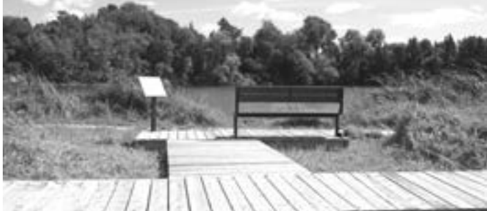
Improved boardwalk at Chapman Mills Conservation Area

To ensure we continue to have clean water, a healthy environment and a sustainable plan for the future, grants and donations are critical , not only to sustain, but also to improve our natural environment.