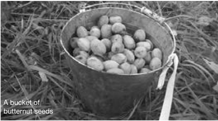
A bucket of butternut seeds