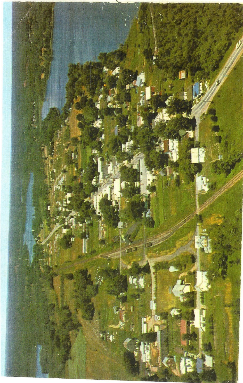
Aurora prior to 1950